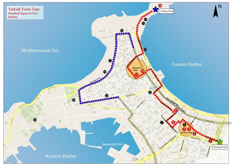
Fig 5: Highlights of the Turkish Town, Alexandria – Egypt

crossed one of the oldest districts of the modern city (post 1805). It travels through old mosques, bazaars and other listed properties on Alexandria's Heritage list. Similar to the experiment in Kaiserslautern, this one was designed for two days. The four male foreign participants started their city tour ten minutes apart from each other.