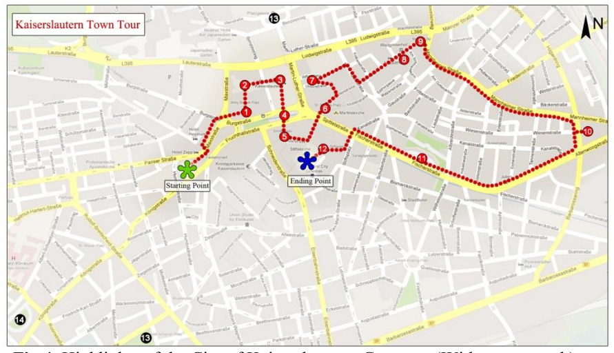
Fig 4: Highlights of the City of Kaiserslautern, Germany (With pre-set path)

The City of Kaiserslautern's architectural culture is characterized by an old, small medieval city centre where just a few original buildings remain. The rest of the city centre is dominated by the reconstructions of architecture after the Second World War. The experiment took place in the inner city area on two days. On both days and in both tests, two female foreigners were handed a city map, , where the highlights of the City of Kaiserslautern were marked. These were for example the city hall or the Fruchthalle. They were asked to pass by all 14 mandatory points of interest (POI) with additional two optional points. The first test took place on Monday, October 8<sup>th</sup> around 11:00 am. They started their city tour 30 minutes apart from each other.