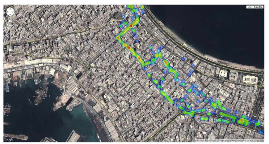
Fig 1: Heatmap of aggregated stress reactions, Alexandria - Egypt

responding video snippets. In this case, an offset has to be specified to match the timestamps of GPS and video data. The extraction of snippets was realized using the ffmpeg library that is available on any common UNIX-based system. These sequences can be used for the identification of the original triggers of stress in chosen urban areas by a visual comparison with the videos and the measurement results. As a result, it is possible to synchronize skin conductance, stress responses with GPS and the video signal. After that, the visual detection of individual impacts on stress - like bad road surface, orientation problems - is possible (compare Exner et al. 2012) and will be elaborated in further research. Finally, the file with identified stress phases can be used as input for the "GenerateHeatmapInput"-component that will automatically generate a JSON representation usable as input for the generation of heatmaps within the RADAR system (Figure 1).