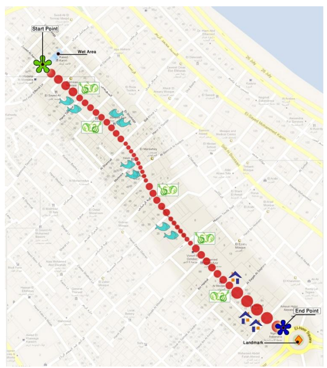
Fig. 3: Al Midan Local Market, Alexandria – Egypt