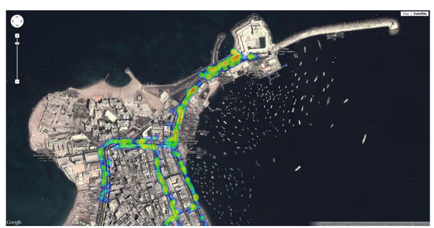
Fig. 7: Heatmap of Agglomerated Stress Reactions, Alexandria - Egypt